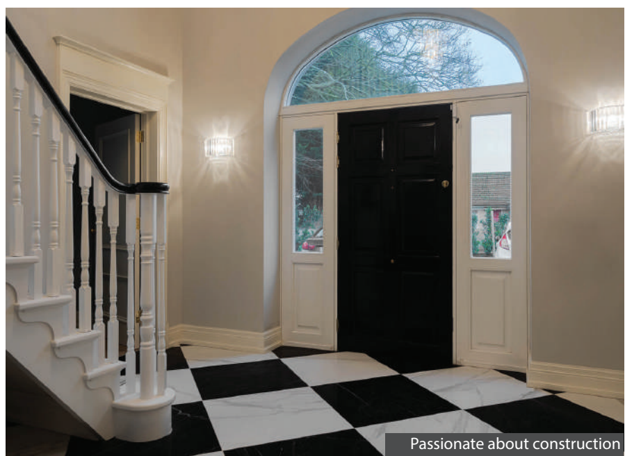
Passionate about construction

"We use mostly local sub-contractors, some who go right back to the 1980's working alongside my dad. This is very important to us as our relationship with them helps us deliver quality finishes