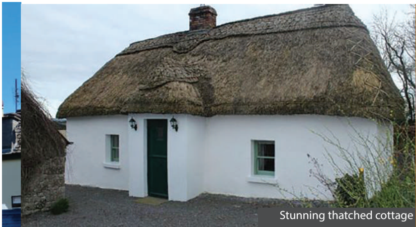
Stunning thatched cottage