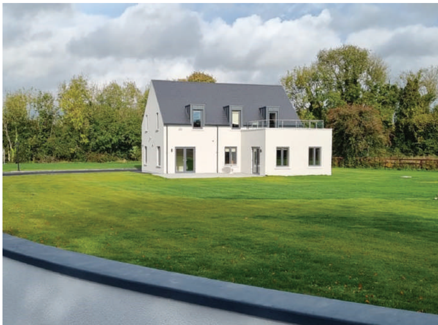
Delivering quality builds for both first-time and repeat clients