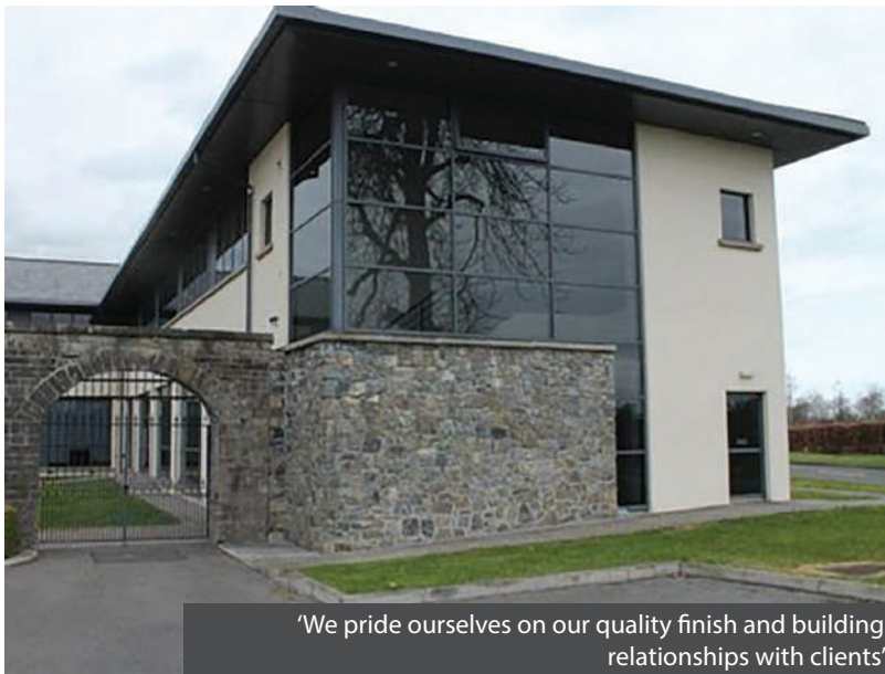
'We pride ourselves on our quality finish and building relationships with clients'