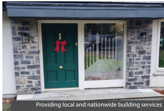
Providing local and nationwide building services