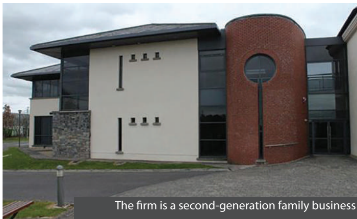
The firm is a second-generation family business